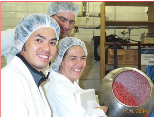
Students “show off” their pan of bubble gum.