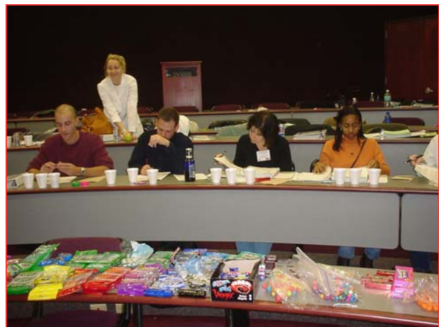
Students score various characteristics of both chewing and bubble gum during the Gum Evaluation portion of the course.